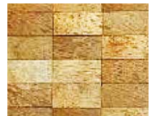
SIPORA KC-014 MATTE FINISH