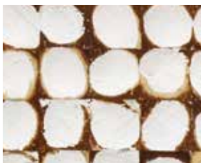
YOGYA WHITE KC-023 MATTE FINISH

Kirei Java Collection tiles are a rigid self-backed tile adhered to a clean, smooth wall surface with construction adhesive.