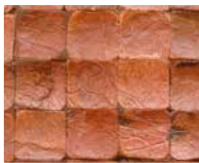
LOSARI LEATHER KC-021 MATTE FINISH