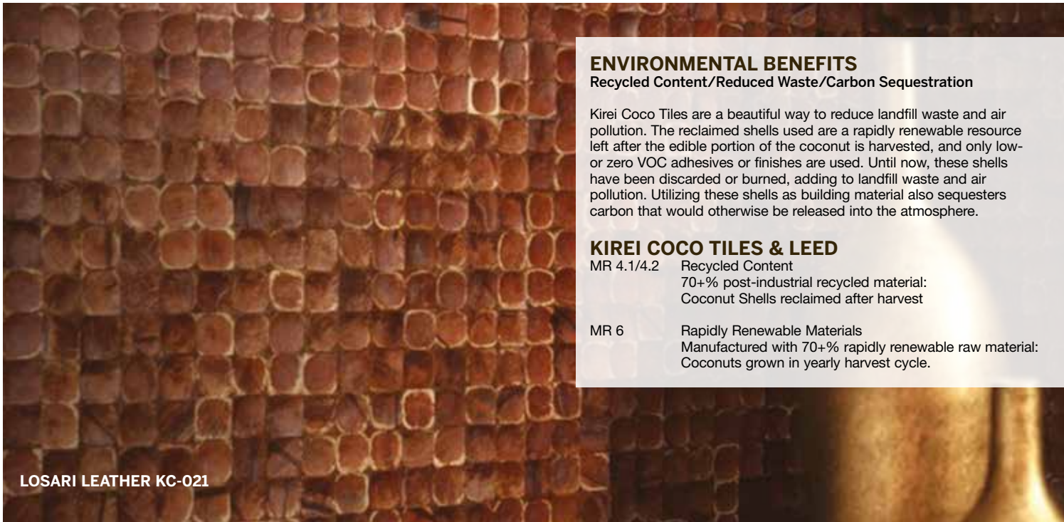
LOSARI LEATHER KC-021