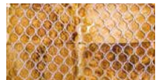
SUMATRA BACK VIEW MESH BACKER