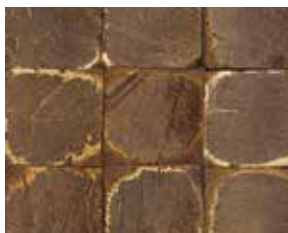
BABAKAN URBAN KC-022 MATTE FINISH