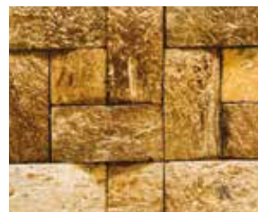
BATAK KC-001 MATTE FINISH

Kirei Sumatra Collection tiles are a mesh-backed tile adhered to a clean, smooth wall surface with construction adhesive.