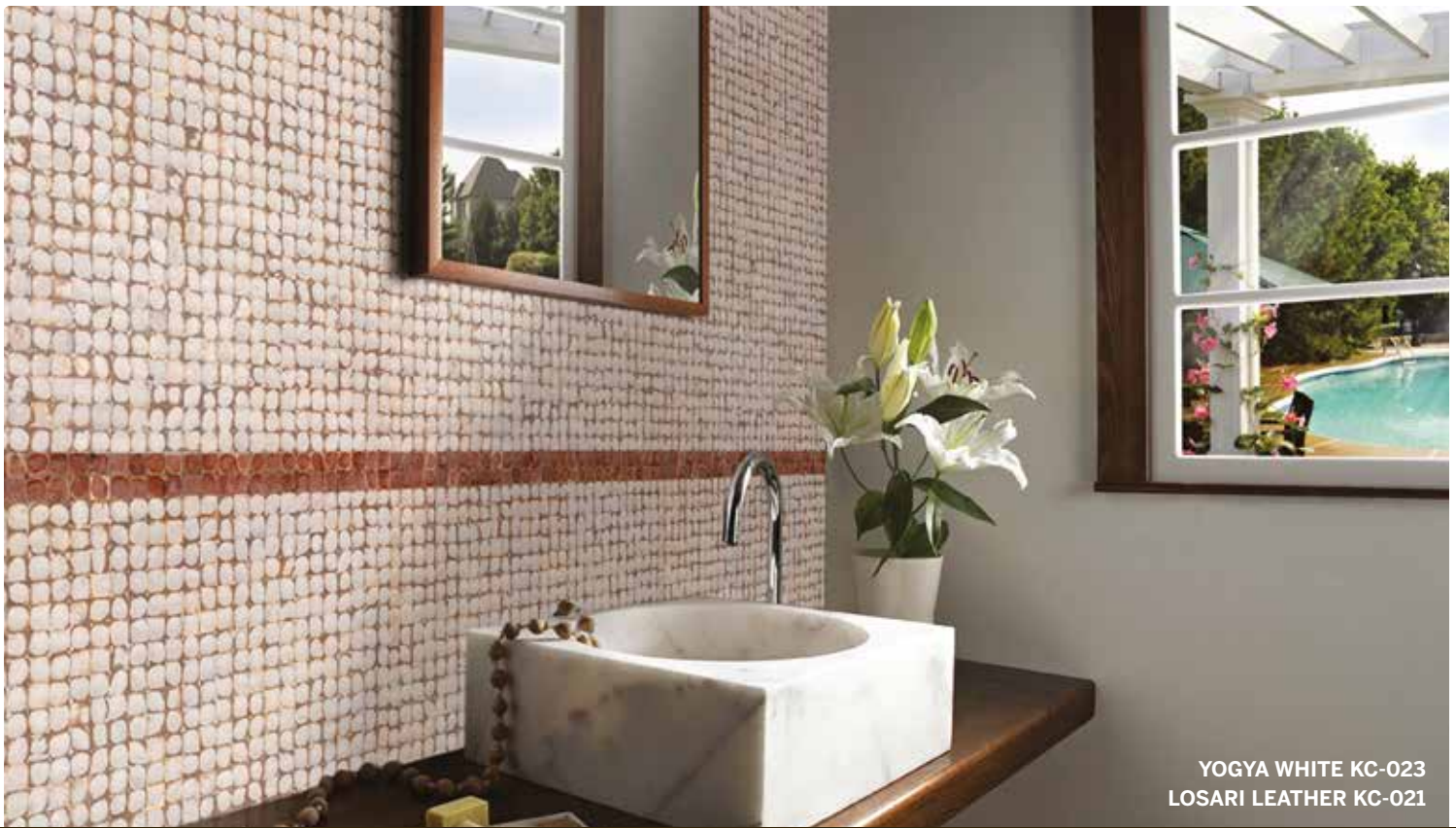
YOGYA WHITE KC-023 LOSARI LEATHER KC-021