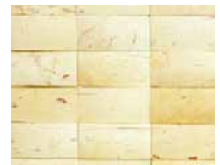
GIDO KC-016 UNFINISHED