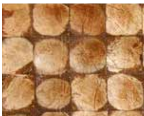
CIREBON NATURAL KC-020 MATTE FINISH