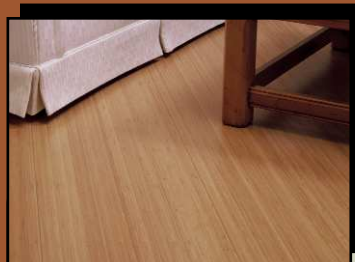
Edge Grain Amber