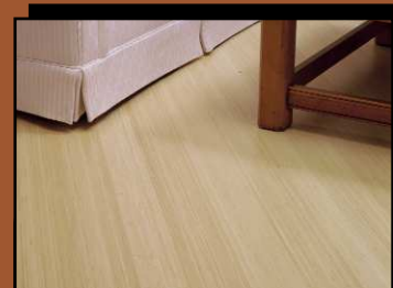
Edge Grain Natural