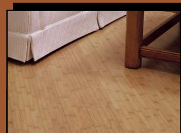
Flat Grain Amber