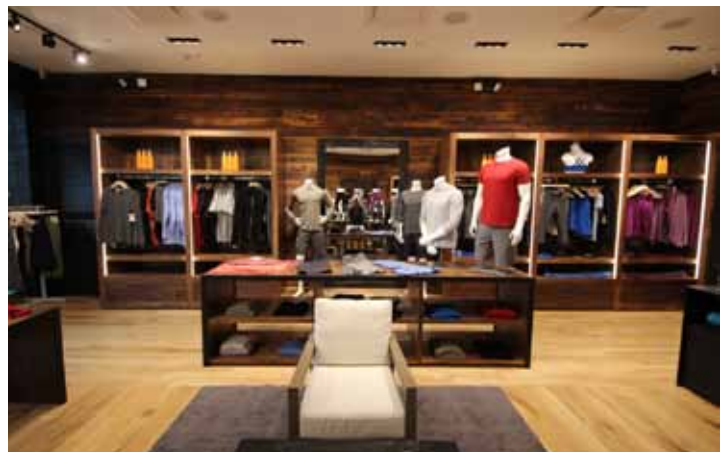
Yogasmoga, Tora - White Plains, NY