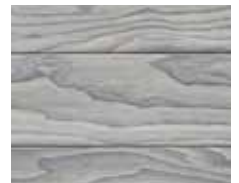
Wabi Sabi (accoya)