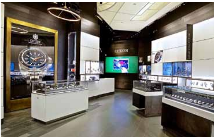
Citizen Watch, Netsu - NYC