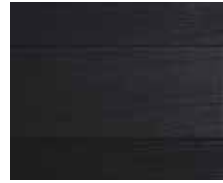
Netsu (red oak)