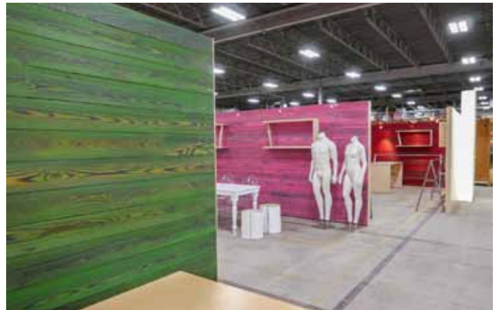
Smartwool Tradeshow, Yasai, Pinku, and Aka