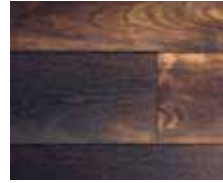
Kurumi (black walnut)