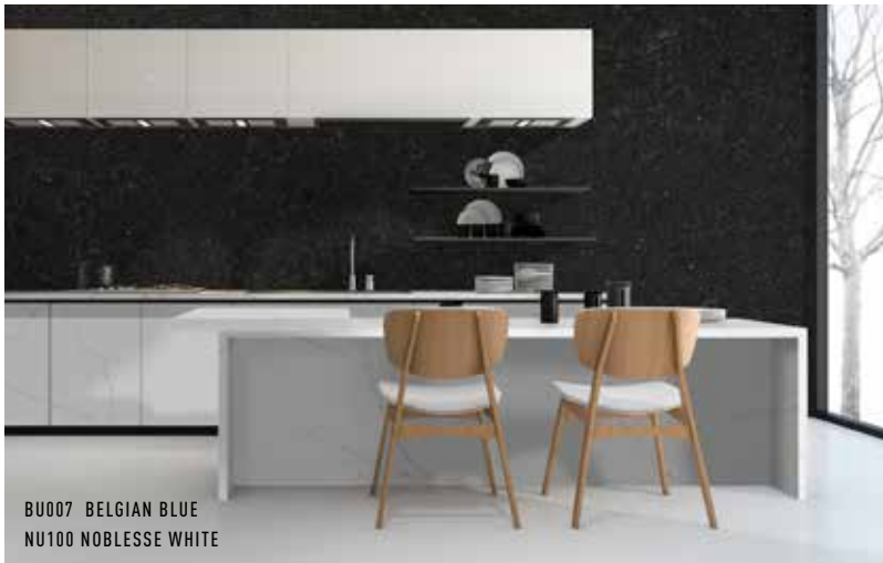
BU007 BELGIAN BLUE NU100 NOBLESSE WHITE