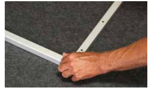
2. Using a white rubber mallet, drive the Tube Connectors fully into the tube ends. Be sure to protect the tube from hard surfaces and denting during assembly.