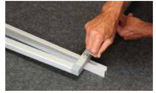
4. Insert Joint Connector Bolt, align to Nut and hand thread. Using a hex driver, tighten while maintaining the Frame and Channel aligned properly.