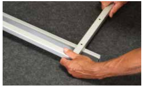
3. Place Channel underneath the frame, slide in hex nuts for assembly (add 2 extra and slide towards center for the Channel positions that are to be used for suspending the EchoSky)