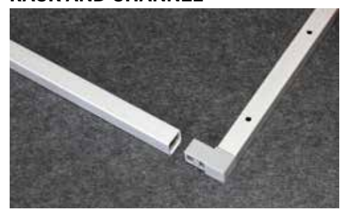
1. Lay out the Tube Frame on a clean, protective surface with the holes facing up.