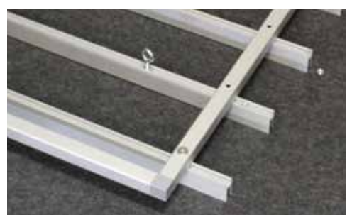
6. Position the extra Hex Nuts and thread in Eyebolt or Set Screw for connecting to the specified suspension system.

Based on specifics of location height, type of mounting hardware and available equipment, the installer may pre-assemble the Rack at ground level with only 2 or 3 Channels and hanging hardware pre-mounted, and complete the assembly of remaining components while suspended.