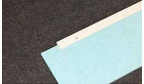
3. Complete channel/baffle set is now ready to mount on rack