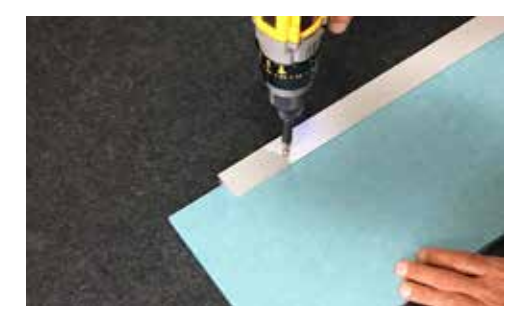
2. Place screw in pre-drilled hole of channel and fasten.