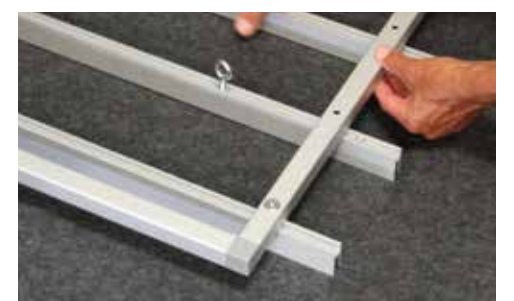
5. Repeat steps for all Channels