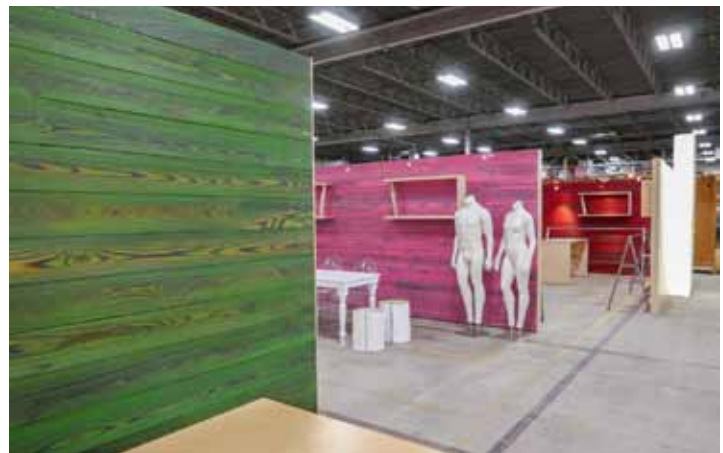
Smartwool Tradeshow, Yasai, Pinku, and Aka