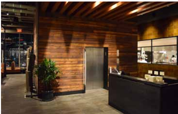
Nordstrom, Tora - Vancouver, BC